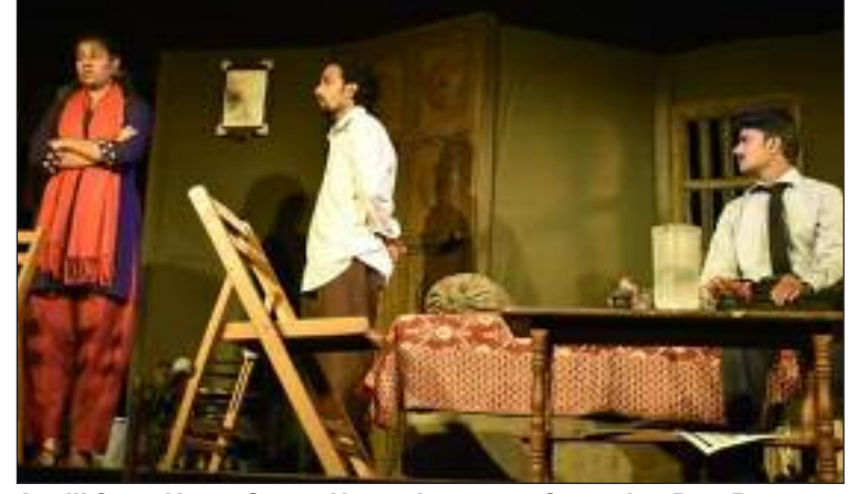
A still from Home Sweet Home drama, performed at Don Bosco Hall, Mangalore recently.

It stands for the up-lift of cultural, social and moral values in society.