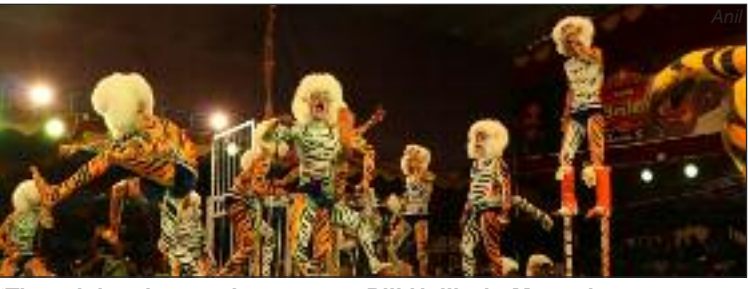
'Tigers' dancing on the stage at Pili Nalike in Mangalore.

with acrobatics, flips, somersaults The performance was filled with