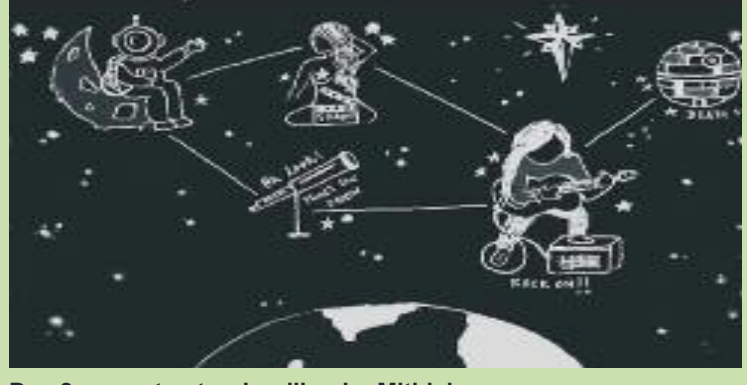
Day 8 prompt - star doodling by Mithisha.

When it came to the prompts she exclaimed, "I absolutely love the randomness of the prompts! I