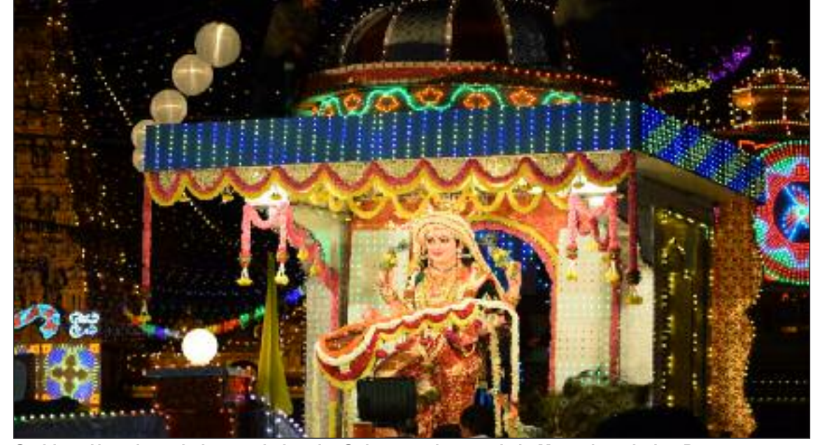
Goddess Navadurga being carried to the Gokarnanatha temple in Mangalore during Dasara.