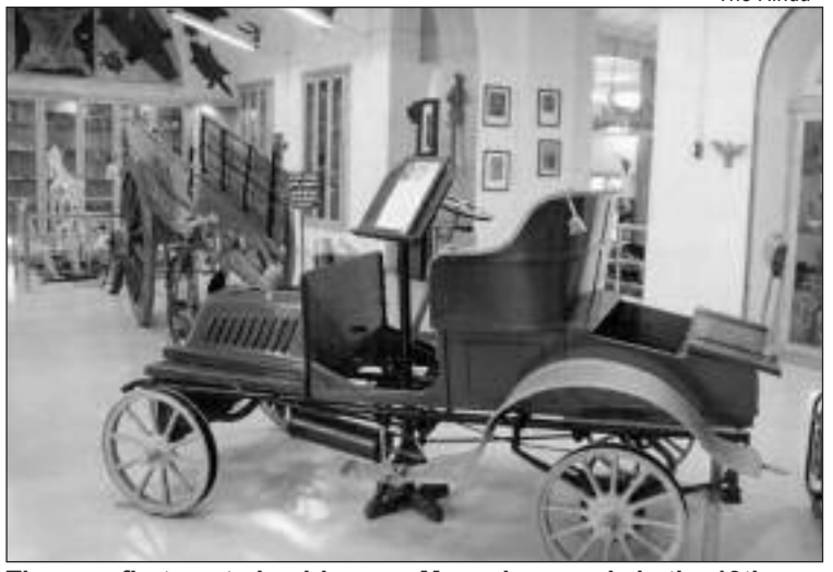
The very first car to be driven on Mangalore roads in the 19th century has been preserved in Aloyseum.