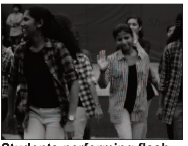
Students performing flash mob in the campus

CAMPUS: As a curtain raiser to Sangam the PG fest, MSc