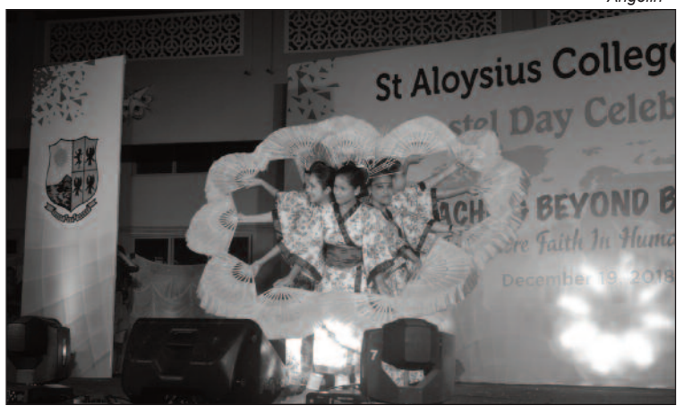
Chinese dance performed by the PG hostel students

Dionysius Vas SJ said, "It is good to see that this platform is used by the students of the hostels to showcase similarities and celebrate the differences." he said.