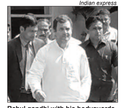
Rahul gandhi with his bodyguards

The minister, however, denied the conversation and said the tapes were fabricated by