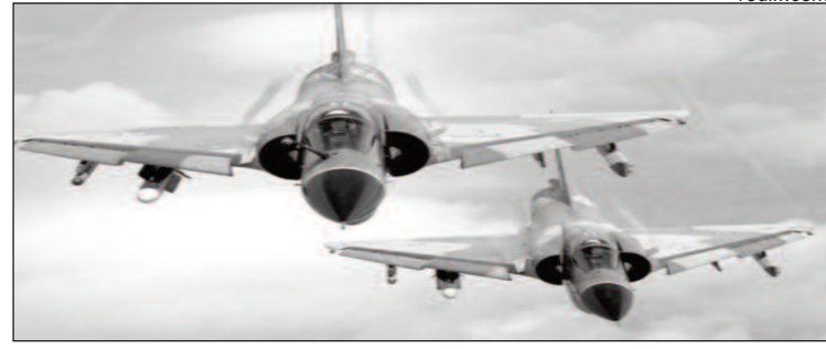
Mirage-2000 jets were used for the air strike

who were being trained for fi- trusion in Muzaffarabad sector happened within "AJK" (Azad Jammu Kashmir). 3-4 miles from the LoC that divides Kashmir between the two rediff.com