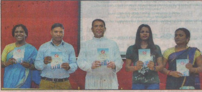
FIGHTING FOR RIGHTS: The activist said transgenders in the state has decided to appeal to the state government to set up district-level cells for the implementation of The Karnataka State Policy on Transgenders, 2017

She was speaking at the release of, 'Domestic and Sexual Violence: Claiming Voice, Rights and Dignity - A Gender Non-Conforming, Trans-