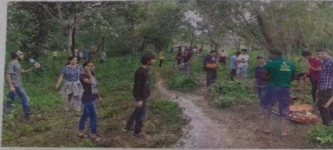
Activists of National Environment Care Foundation, Mangaluru, planting different fruit-bearing saplings in Ichlampady and Mardala reserve forest areas in Dakshina Kannada on Sunday.

Farmers in Dakshina Kannada, especially on the foothills of the Western Ghats, have been constantly facing a threat from wild animals, including monkeys and boars, to their crops. The monkeys and wild boars targeted particularly arecanut, coconut, banana, cocoa and vegetable crops. One of the reasons attributed for their increasing attacks on farm land is the destruction of fruit-bearing trees in the forests by the timber mafia and others. Unable to find food, they attacked the nearby farms.