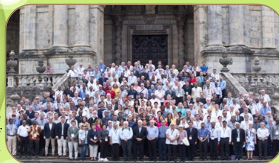
Conference Participants in Bilbao (outside the Sanctuary of Loyola)

Presided by the King of Spain, Felipe VI; the president of the Basque Government, Iñigo Urkullu; and the Father General of the Society of Jesus, Arturo Sosa SJ