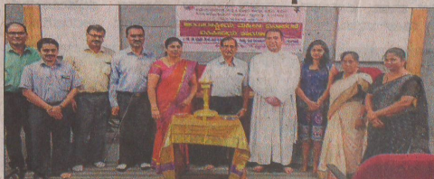
ಅಂತರರಾಷ್ಟ್ರೀಯ ಮಹಿಳಾ ದಿನಾಚರಣೆ ಅಂಗವಾಗಿ ನಗರದ ಸೇಂಟ್ ಅಲೋಶಿಯಸ್ ಕಾಲೇಜಿನಲ್ಲಿ ಶನಿವಾರ ವಿಶಿಷ್ಟರಿಯಾ ಕಾರ್ಯಾಗಾರ ಆರಂಭವಾಯಿತು.