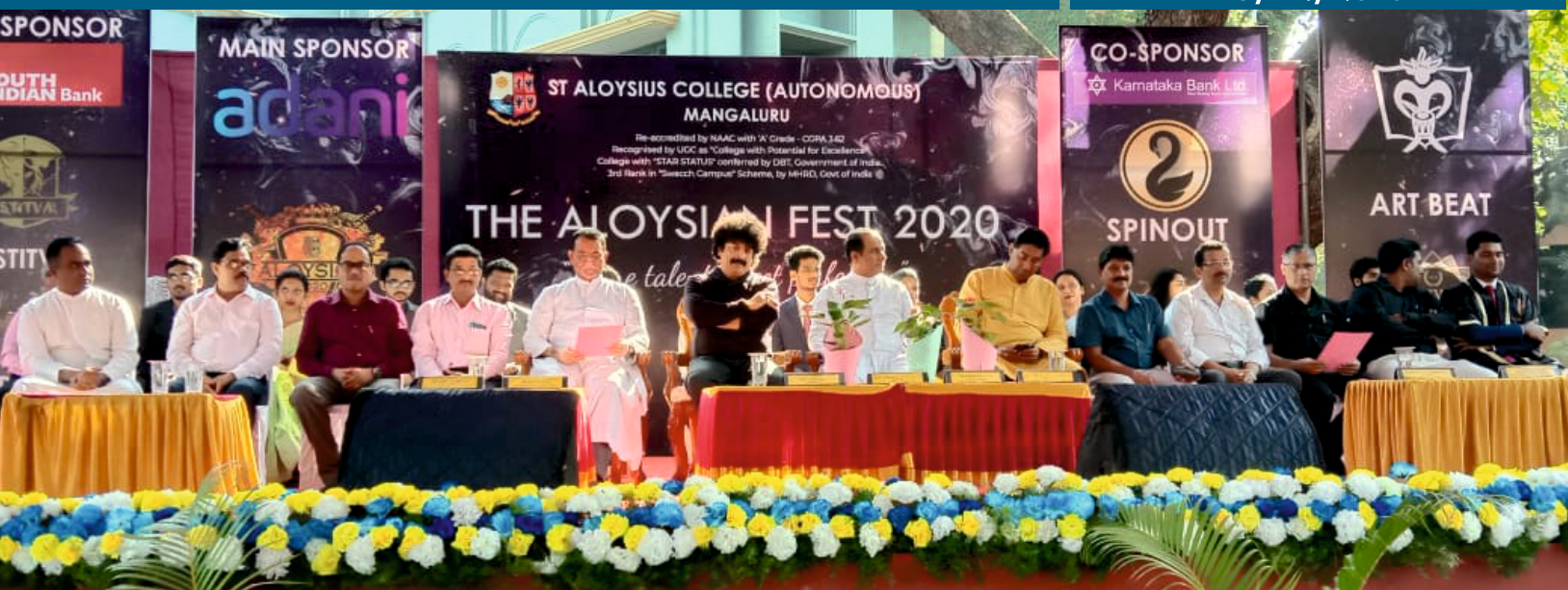
Aloysian Fest - 30-31 January & 1 February 2020