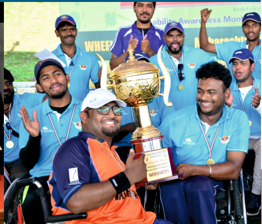
Wheel Chair Cricket Match 10/12/2019