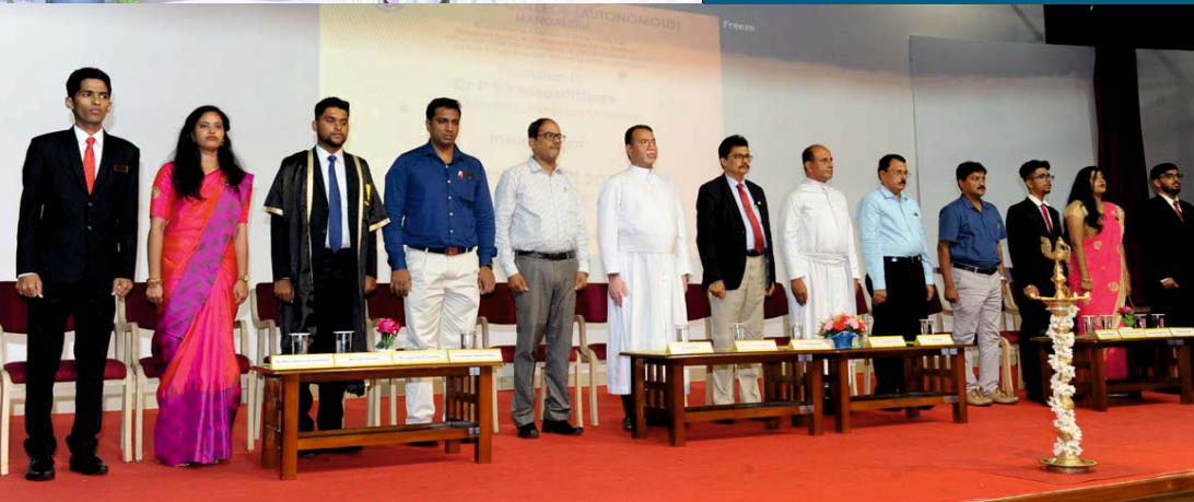
Inauguration of Student Council - 26 June 2019