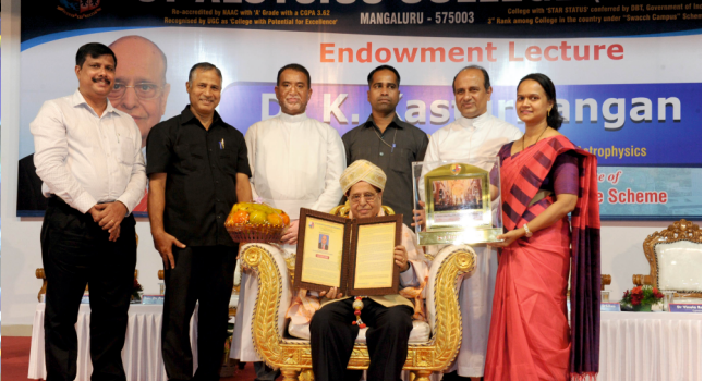
Endowment Lecture by Dr Kasturirangan-4/12/2019