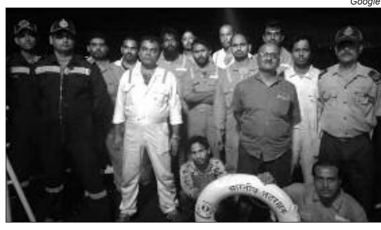
Coast guard personnel with the crew of stranded dredger.

A repair team comprising of divers arranged by owner on pursuance of Coast Guard and NMPT, escorted by Deputy Conservator, NMPT himself was embarked on the vessel by