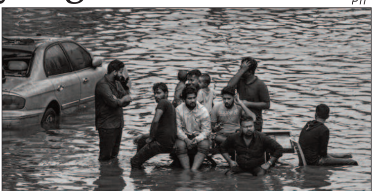
A view of a flooded street following heavy rains in Mumbai

On Wednesday, flight delays at the Mumbai airport were on two counts — poor visibility and staff being unable to report for on-time duty. At 12 p.m., Swedish airport and airline tracker Flightradar24 said that 9% or 42 incoming flights were delayed and 16 arrivals into Mumbai had been cancelled. There was a 20-minute average delay in departures, with 131 (29%) reporting delays. Sixteen departures had been cancelled, the tracker said