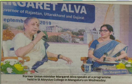
Former Union minister Margaret Alva speaks at a programme held in St Aloysius College in Mangaluru on Wednesday.