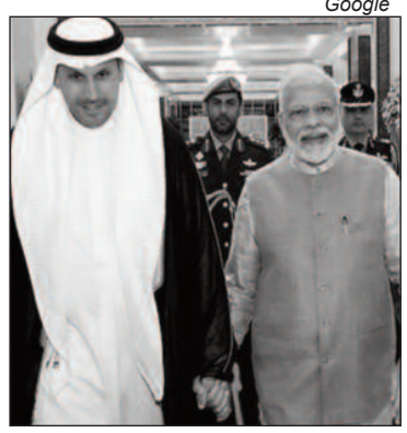
PM Modi in AbuDhabi

The Prime Minister would pay a state visit to the Kingdom of Bahrain from August 24-25 in the first ever Prime Ministerial visit from India to