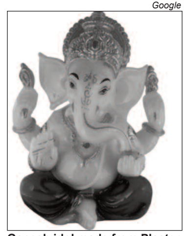
Ganesh idol made from Plaster of Paris.

The board has directed local bodies in the State to inspect